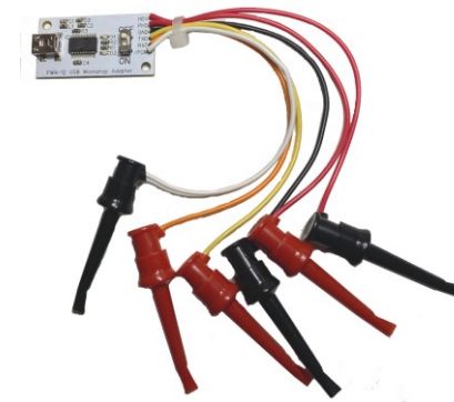
Figure 1. FWA-12 USB Workshop Adapter